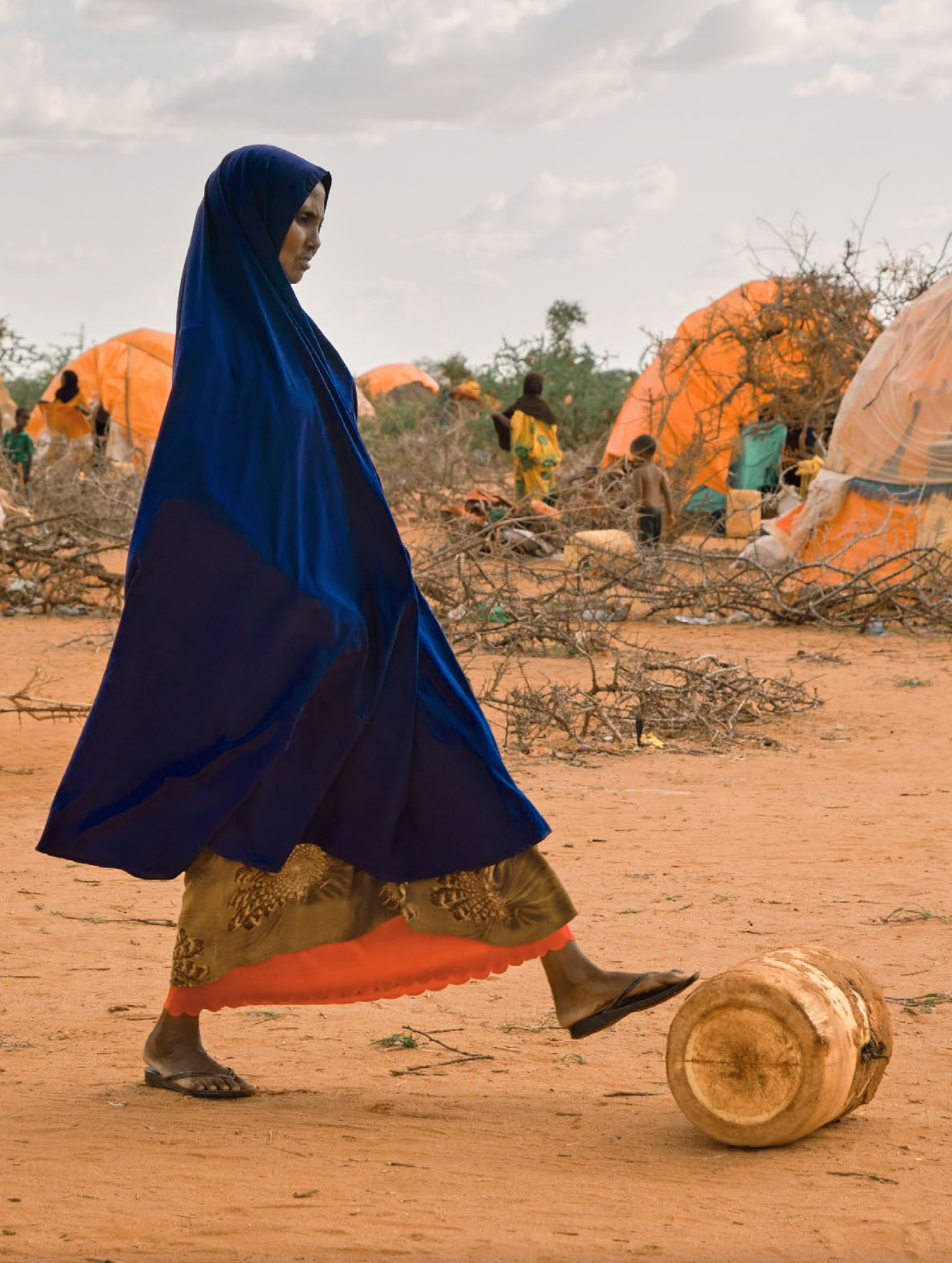
Over 760,000 people have been displaced from their homes due to the extreme drought that is affecting Somalia and the Horn of Africa. Most displaced persons head to larger urban centres like Doolow.