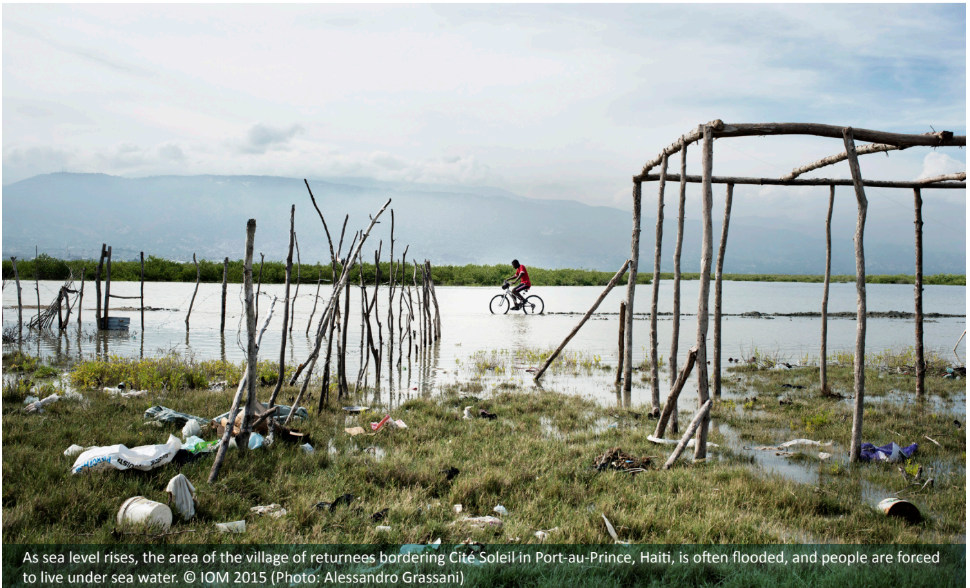
As sea level rises, the area of the village of returnees bordering Cité Soleil in Port-au-Prince, Haiti, is often flooded, and people are forced to live under sea water.