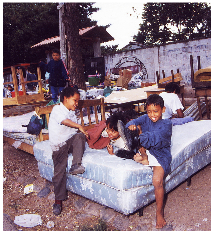
In Honduras, young victims of Hurricane Mitch wait for IOM relocation assistance. A series of temporary shelters have been set up to house those who have lost their homes.

Regarding measures in non-return cases, the United States legislation, for example, provides for TPS as an exceptional migratory category for foreigners affected by a disaster in their country of origin and already on the territory of the United States. This measure, although currently being re-examined, was enacted for several major disasters, such as the regional Hurricane Mitch in 1998, and the earthquakes in Haiti, 2010 and Nepal, 2015 (Cantor, 2016). Caribbean countries, including the Bahamas, Dominica, the Dominican Republic, Jamaica and the Turks and Caicos Islands, also had announced non-return policies for Haitians already on their territories (Nansen Initiative, 2015c).