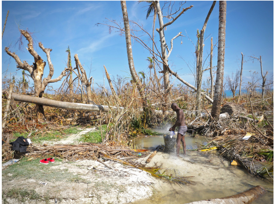
Over 175,000 people have been displaced from their homes since the passage of Hurricane Matthew in Haiti on 4 October 2016.

Regarding the first type, the decision to move seems to be influenced by the perception of stronger temporary protection and assistance on the other side of the border, and also by broader regular migration patterns over those borders (Cantor, 2015a). Sometimes, crossing a neighbouring border is also the simplest and fastest or the only way for people to put distance between themselves and the anticipated disaster. One example of these border crossings is in Northern Guatemala to Mexico, where people use the “frontier worker visitor card”, held by many Guatemalans along the northern frontier, to cross over when a disaster hits (ibid.). These movements usually happen ad hoc and thus, governments and border authorities need to be prepared to identify and support those in need of assistance.