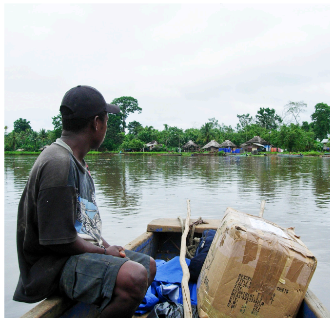
Pre-positioning of emergency kits in strategic points of the border as part of IOM's Emergency Assistance Programme in Panama.

Finally, the process leading to the adoption of a global compact for safe, orderly and regular migration offers a unique opportunity to bring the environmental and climate factors in the migration management policy. If States choose to design an implementation and monitoring mechanism for the compact at the regional level, disaster displacement and environmental migration will stand a better chance to be addressed. Most of these movements happen among countries within a region, and thus experiences of governments with such movements are often similar. Regional organizations are also often more coherent in terms of interests of Member States and thus, their agendas more straightforward to set (PDD, 2018).