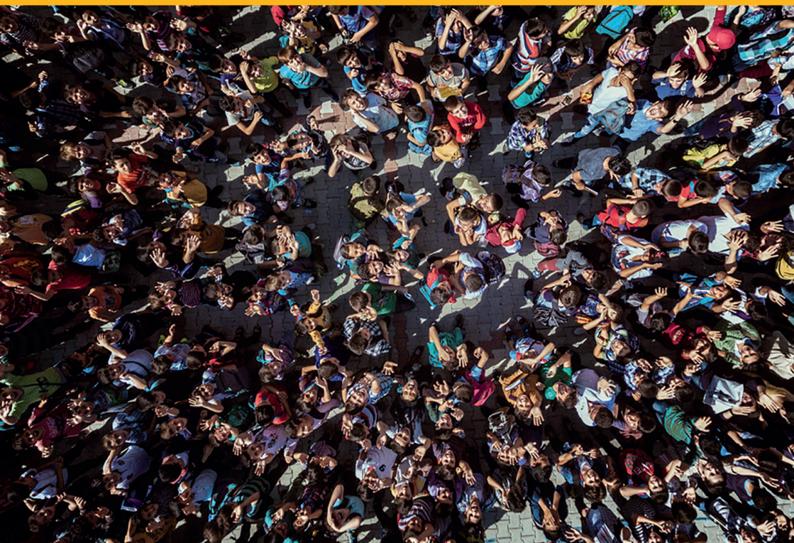
Syrian refugee children get ready for class at the SSG, a multi-service centre supported by IOM. Hatay, Turkey.