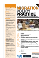
Migration Policy Practice (Vol. VII, Number 3, October–November 2017)