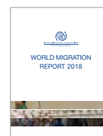
World Migration Report 2018