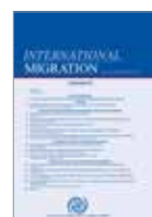
International Migration Volume 55 (6) December 2017