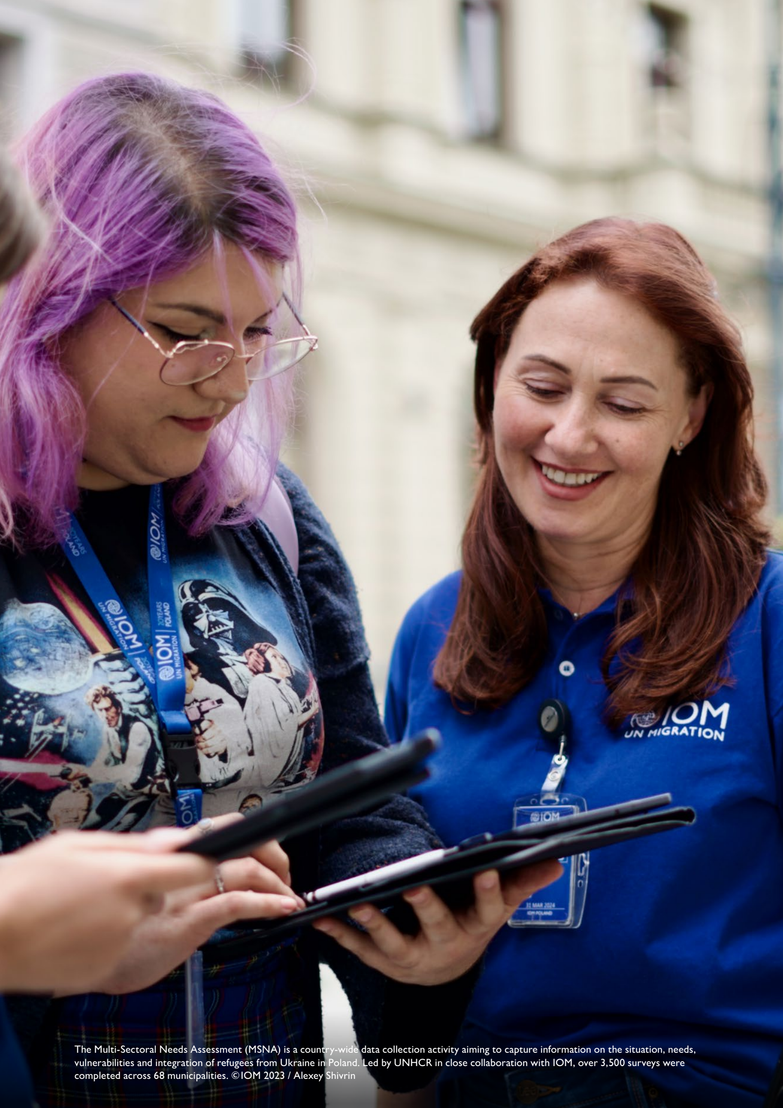
The Multi-Sectoral Needs Assessment (MSNA) is a country-wide data collection activity aiming to capture information on the situation, needs, vulnerabilities and integration of refugees from Ukraine in Poland. Led by UNHCR in close collaboration with IOM, over 3,500 surveys were completed across 68 municipalities.