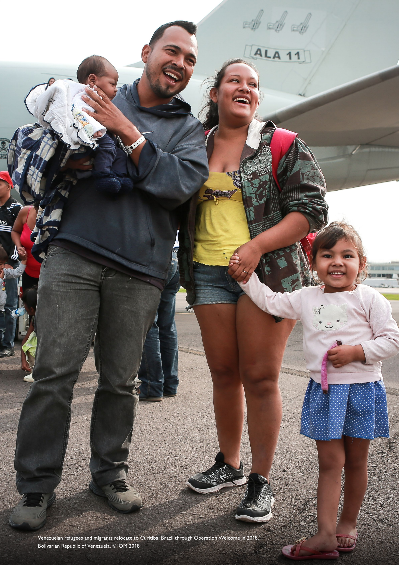
Venezuelan refugees and migrants relocate to Curitiba, Brazil through Operation Welcome in 2018. Bolivarian Republic of Venezuela.