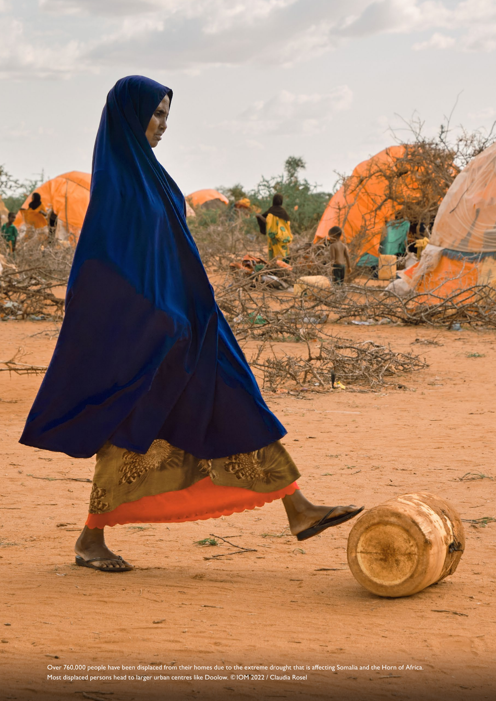
Over 760,000 people have been displaced from their homes due to the extreme drought that is affecting Somalia and the Horn of Africa. Most displaced persons head to larger urban centres like Doolow.