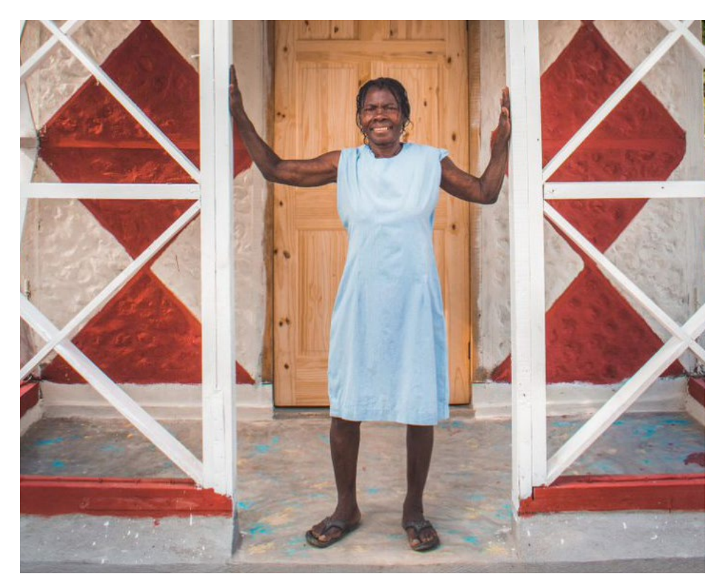
IOM has been promoting the Building Back Safer principles, as well as monitoring and coordinating all repair and reconstruction activities in the departments affected by Hurricane Matthew.

- Disaster risk reduction activities, including training and technical assistance for national counterparts, as well as preparation and response to natural disasters through "build back safer" and evacuation management. IOM will continue to ensure the warehousing management of the emergency NFI stockpile for 10,000 households, prepositioned in 4 warehouse locations. IOM will provide capacity-building trainings to key national and humanitarian actors and support the rehabilitation of public buildings used as priority evacuation shelters during potential disaster. IOM will also contribute to the Government's efforts in reducing the impact of disasters on the most vulnerable populations by strengthening disaster preparedness and response capacity in the Sud, Sud-Est, Grand'Anse and Nippes departments of Haiti. IOM will be conducting assessments, repairs and upgrades of evacuation centres, while also engaging the communities and local authorities in evacuation planning and preparedness.