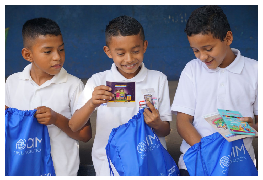
IOM provides child-friendly information on migration.