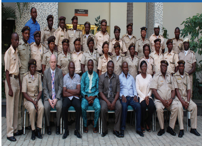
NIS officers from the south eastern zone on the last day of training