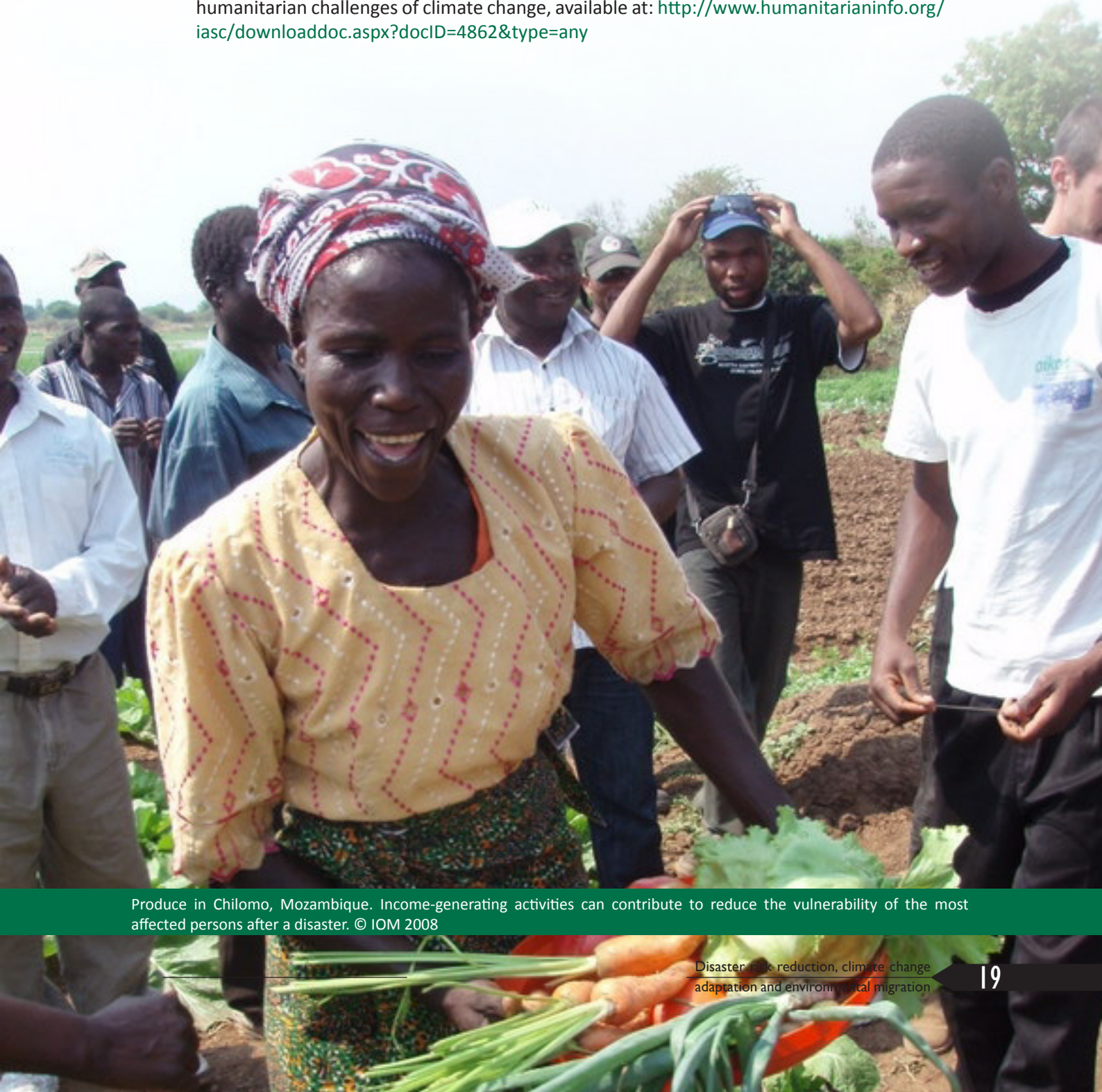
Produce in Chilomo, Mozambique. Income-generating activities can contribute to reduce the vulnerability of the most affected persons after a disaster.