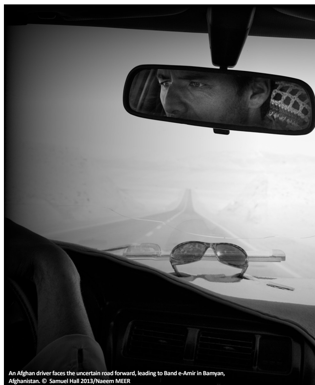
An Afghan driver faces the uncertain road forward, leading to Band e-Amir in Bamyan, Afghanistan.

* https://creativecommons.org/licenses/by-nc-nd/3.0/igo/legalcode