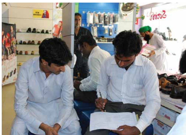
Household survey carried out by trained interviewers

Among its key recommendations for reaping the developmental benefits of remittances to Pakistan, the study suggests that the cost of overseas migration needs to be reduced by improving the recruitment system and controlling the exploitative practices. It also recommends that Pakistan's banking sector needs to be made more efficient to attract remittances through formal channels and directing them towards investment in the country.