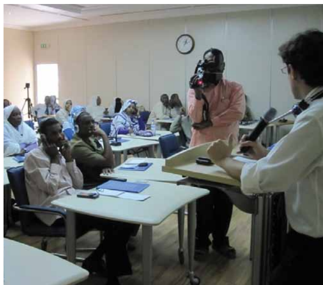
Training session on migration data for the staff of the Centre for Migration Development and Population Studies 19 to 20 January

An essential component of this 1035 Facility funded project is capacity building for the research centre itself. Focusing on data collection, data management and analysis, and essential research skills, IOM is providing on-the-job training, as well as focused training courses for centre staff. For example, IOM's Research team helped run a training course on Migration Profiling for the staff and Technical Working Group, and other training has been identified in demography, migration and computer skills. This will help ensure that centre staff have all the necessary skills required to regularly update the Migration Profile and undertake other research projects. IOM is also ensuring the research centre has the necessary equipment to carry out its functions and, through the provision of migration-related books, journals and periodicals, is also supporting the development of a Migration Documentation Centre.