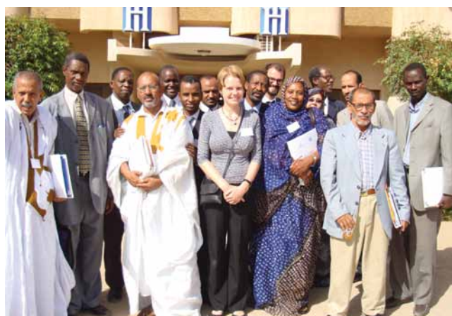
Labour Migration Training Workshop in Mauritania (November 2008)

Nouakchott. The aim of this training was to enhance the capacity of government officers and workers unions to manage labour migration and to protect migrant workers rights. The training targeted officers from the Ministry of Labour and the National Employment Agency, as well as Worker's Union's Representatives.