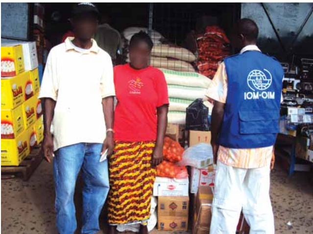
Family members of Victims of Trafficking (VoTs) that benefited from the 1035 Facility reintegration assistance

“Liberians need to be sensitized on the perils of human trafficking. The need to equip our law enforcement agencies with knowledge and skills to combat trafficking cannot be understated”, said Minister of Labour Tiawon Gongloe at the opening ceremony of the Counter Trafficking training workshop organized by IOM Liberia in Monrovia. The Minister, Chair of the Liberian Anti-human Trafficking Task Force has spearheaded efforts to step up the fight against trafficking and has encouraged agencies to work together to stem the increasing number of trafficking cases.