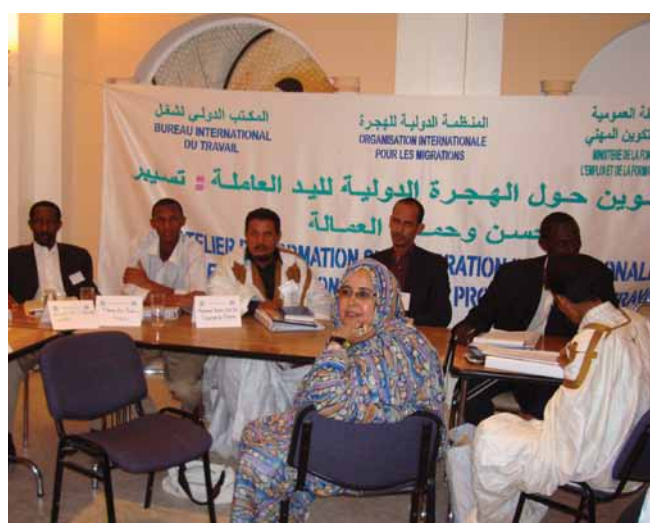
Labour Migration Training Workshop in Mauritania (November 2008)

Sharing experiences and best practices in labour migration management through a study visit in Morocco: In February 2009, a Study Tour to Morocco was organized with the aim to exchange best practices and share experiences in the area of labour migration management. A visit to the ANAPEC (Morocco's National Employment Agency), an institution with extensive experience in managing labour migration programmes to France and Spain, was part of the programme of the Study Visit.