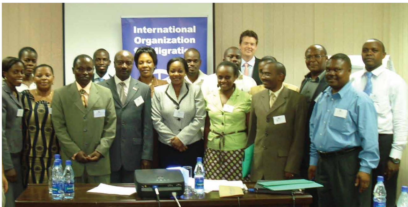
Tanzanian and Ugandan participants of the capacity building workshop held on 26 November 2009 in Dar es Salaam

In order to effectively share these findings and to inform the development of Government policies and daily activities, a capacity-building workshop on the role of remittances for national development was organized in November 2009, targeting Ugandan and Tanzanian staff from key Ministries and the respective Post Offices.