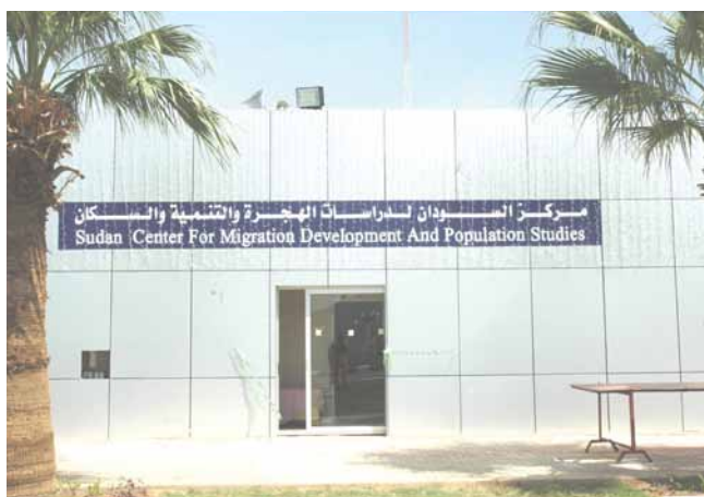
Inaugurated on 27 September 2009 the centre will collect manage and analyse migration data in a bid to help the Sudanese government manage migration

A Technical Working Group has been established to support the research. Made up of representatives from all government institutions involved in migration (such as the Ministry of Interior, the Ministry of Foreign Affairs, and the Ministry of Labour), as well as the Central Bureau of Statistics, this collaborative effort will help ensure the end result – the Migration Profile – will be accepted and owned by all institutions and used to develop appropriate migration policies. The Migration Profile should be available by July 2010.