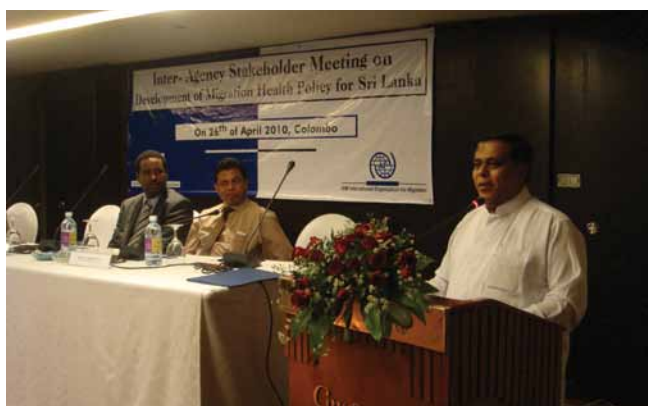
Hon. Minister Nimal Siripala De Silva, addressing the inter-agency stakeholders meeting to discuss the development of a migration health policy for Sri Lanka

"Our migrant health policy must be respected by migrant receiving countries in order to be effective. It needs to offer strong guidelines for policies which can be adopted by other countries," he said.