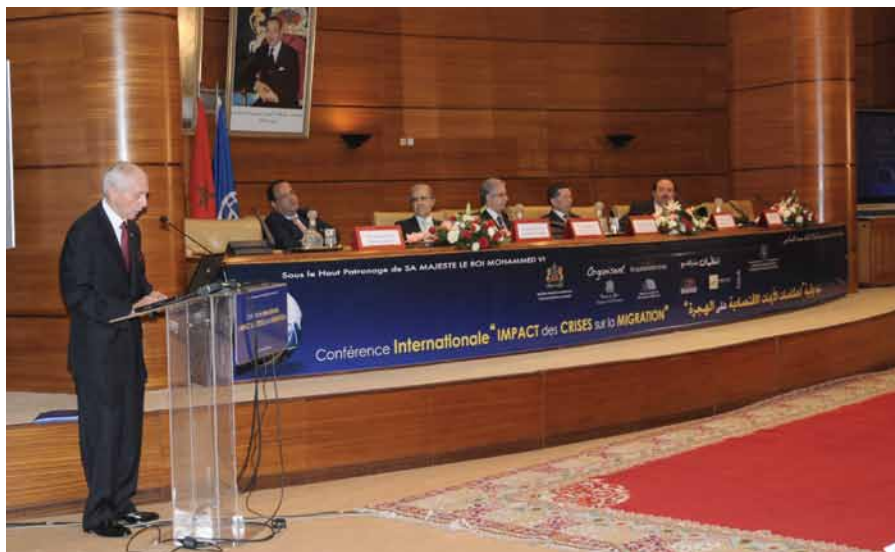
Opening speech by M William Lacy Swing, the Director General of IOM, at international conference in Rabat

Participants agreed that migrant workers require protection during financial crises, not only due to unemployment, but also because