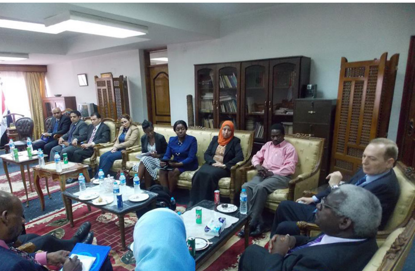
Government delegates from Zimbabwe learn from their Egyptian counterparts about how to effectively implement the policy on fighting trafficking in persons. © IOM 2015 (Photo: Official from the Government of Egypt)