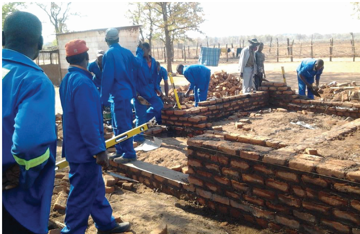
Some of the vocational skills students in the community near the Tokwe Mukorsi Dam participate in the livelihood programme.

Furthermore, IOM facilitated training for 378 students in dress making, carpentry and building. The students who were trained are already having an impact in the community through the construction of toilets, construction of a staff house as a local school and production of furniture items.