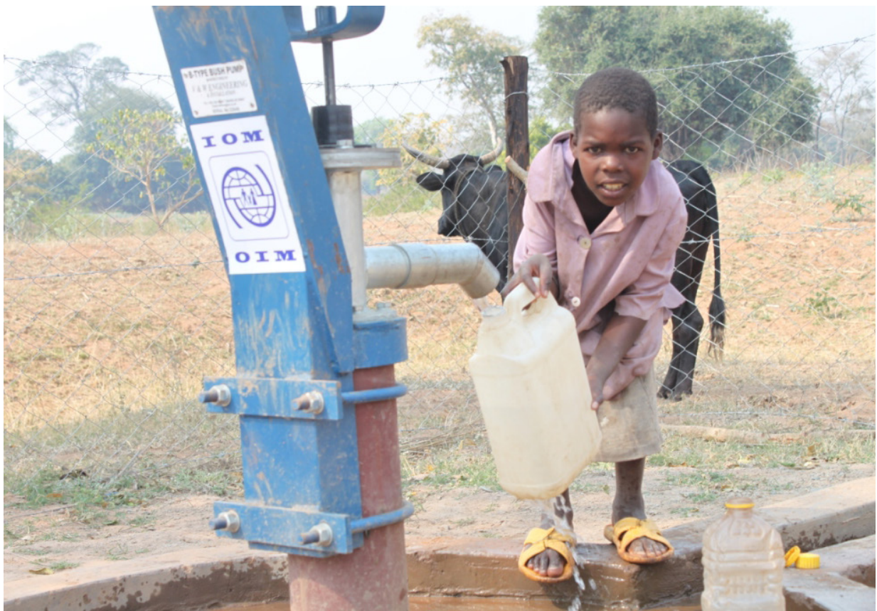
IOM has supported improved access to safe drinking water for IDP and host communities in Zimbabwe.