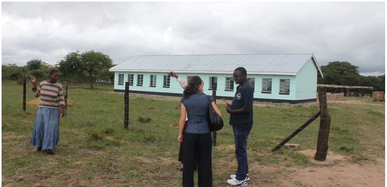
After: IOM supported the construction of school classroom blocks in migration-affected communities in Vungu District, Zimbabwe.