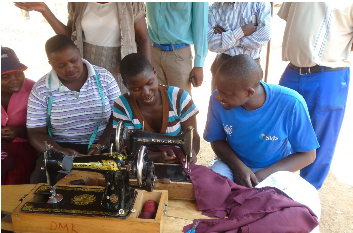
IOM supported skills training for resettled IDPs in Chingwizi, Mwenzei district Zimbabwe.

Whereas IOM is already integrating gender issues into its programming activities, IOM Zimbabwe is also currently developing a gender mainstreaming guideline for the mission.