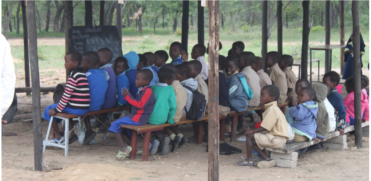
Before: Children learn in makeshift shelters, Vungu District, Zimbabwe.