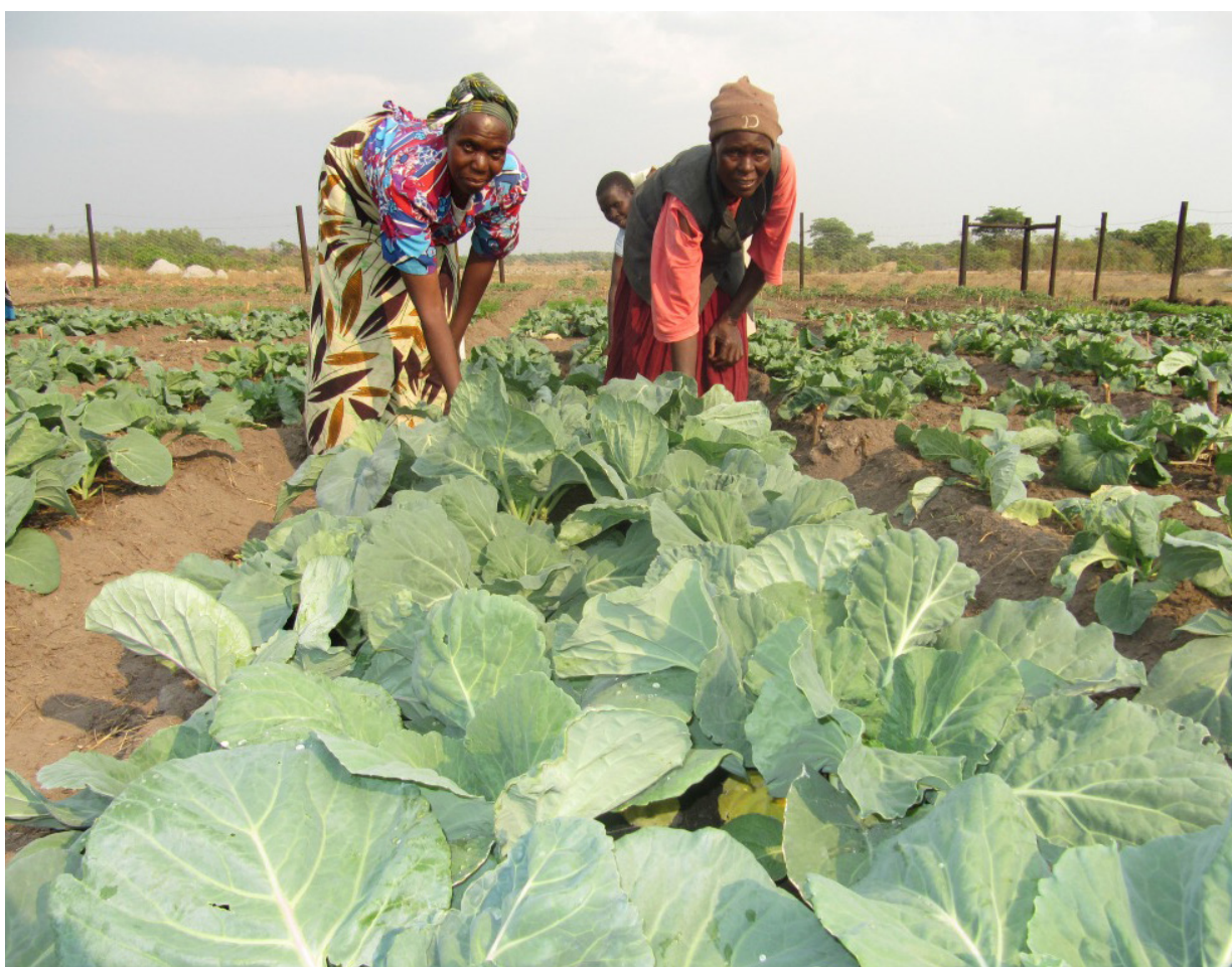
IOM supported livelihood gardens for resettled internally displaced persons in Zimbabwe.