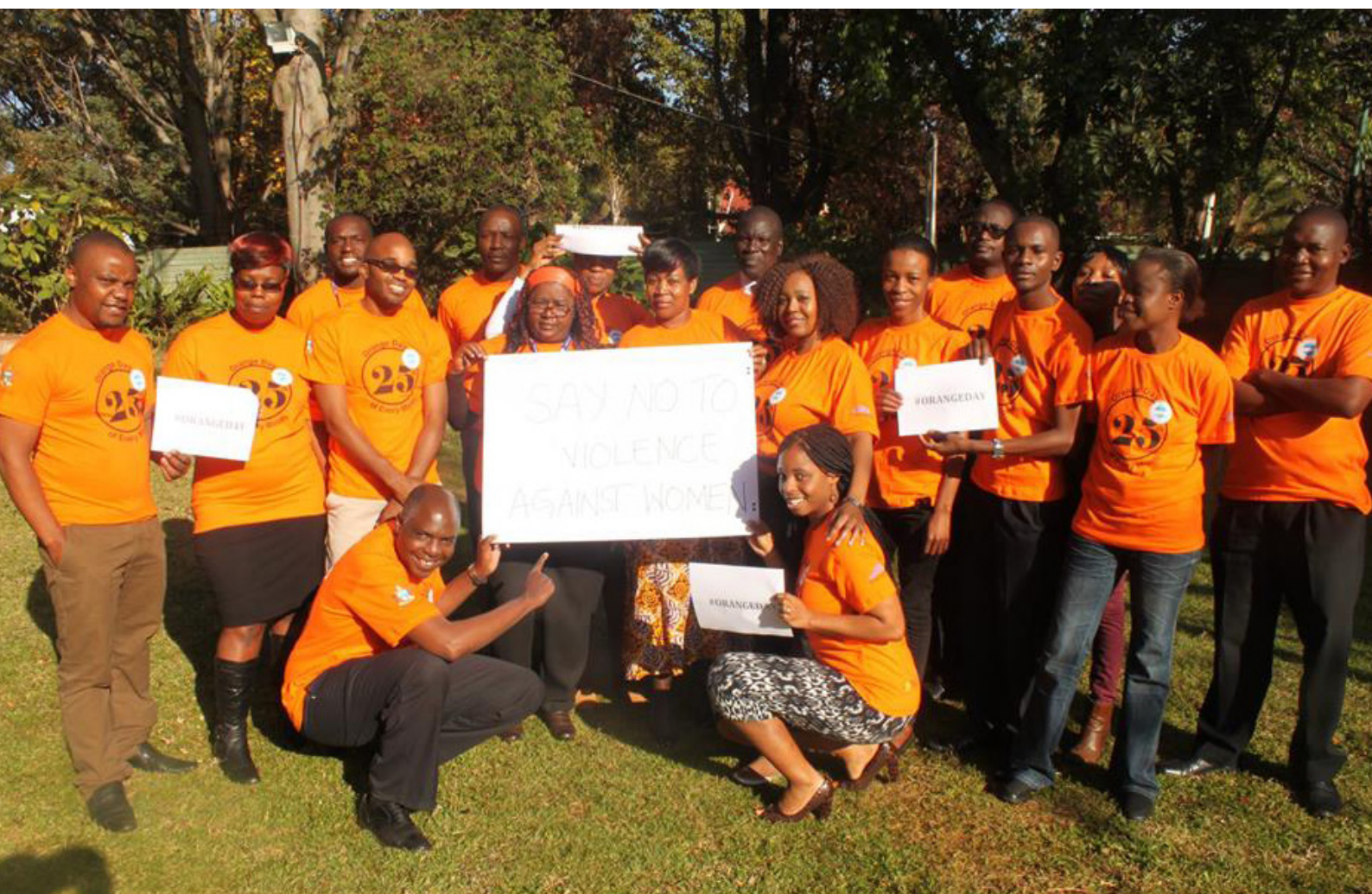
Happy Orange Day! On 25 September 2015, IOM staff commemorated the September Orange Day theme centred on the new 2030 Agenda for Sustainable Development. The new agenda recognizes that gender equality, empowerment of women, and elimination of violence against women and girls are central to sustainable development for all.