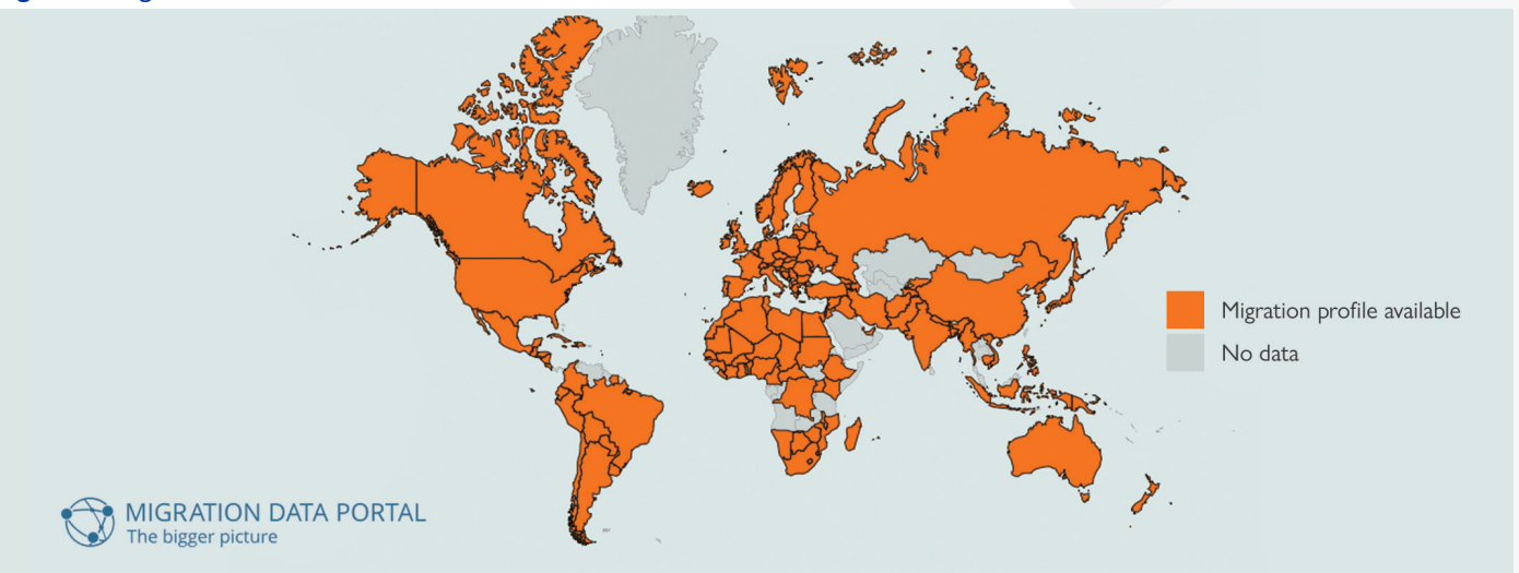
Figure 1: Migration Profiles in the world